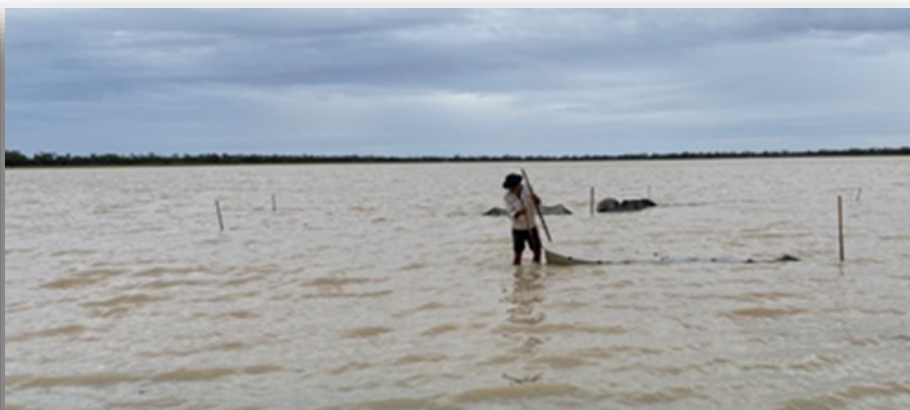
Samples caught in Lake Karratta and Lake Yumbara at Currawinya National Park