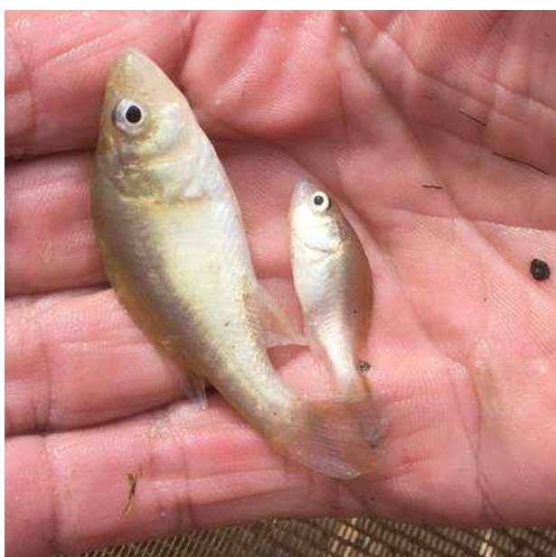
Yellowbelly in varying sizes