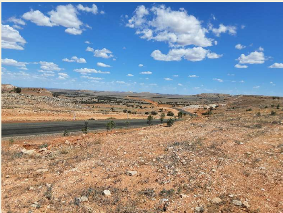
Potential Rest Area Site – Arrabury Road Site

Providing rest areas at sites with picturesque views is one of many ideas Mayor Tractor has, this will provide an opportunity for a day picnic trip or for overnight camping. Tamie is working on a strategy for multiple locations, which will include providing information signs, about the history of the area and its interesting features. This item will be included in next financial year's draft budget for Council's approval.