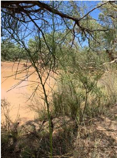
Parkinsonia plants along the river