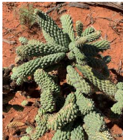
Coral Cactus at Black Gate