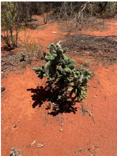
Coral Cactus at Hungerford